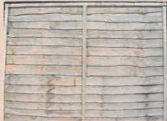
LARCH PANEL 6' wide x 6' high £22.95

Harrowlap panels are manufactured to a very high standard. Fully framed with 65mm top and bottom rails, three battens both front and back, making them one of the strongest larch lap panel available. All panels pre treated and capped.