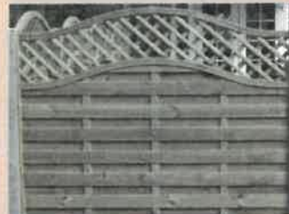
OMEGA LATTICE TOP 1.8m x 1.8m £64.99

Premier Close Board Panels are dip treated have ex 50x32mm rails, clad with 125x22mm feather edge boards. Complete with capping. All panels 1.83m wide. We recommend 2 man handling.