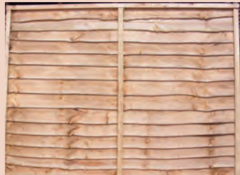
LARCH PANEL 6' wide x 6' high £17.50

Harrowlap panels are manufactured to a very high standard. Fully framed with 65mm top and bottom rails, three battens both front and back, making them one of the strongest larch lap panel available. All panels pre treated and capped.