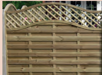
OMEGA LATTICE TOP 1.8m x 1.8m £55.00

Premier Close Board Panels are dip treated have ex 50x32mm rails, clad with 125x22mm feather edge boards. Complete with capping. All panels 1.83m wide. We recommend 2 man handling.