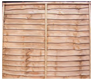
BUDGET LARCH PANEL 6' wide x 6' high £14.65

Executive panels are pressure impregnated have ex 50x32mm rails, clad with 125x22mm feather edge creating an increased overlap. Complete with capping. All panels 1.83m wide. We recommend 2 man handling on 6x6 panels.