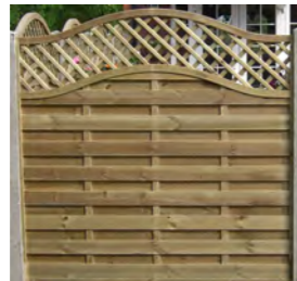
OMEGA LATTICE TOP PANEL 1.8m x 1.8m £49.50

VARIOUS OTHER CONTINENTAL FENCE PANELS ARE AVAILABLE TO ORDER, FOR MORE INFORMATION PLEASE CALL EITHER SALES DEPOT ON